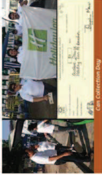
Can Collection Day