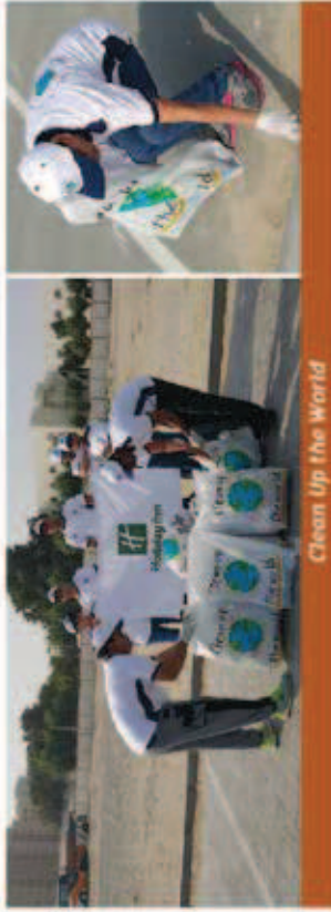
Clean Up The World