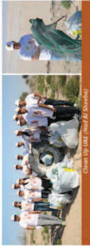
Clean Up UAE (Nad Al Sheeba)