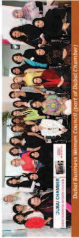
Dubai Business Women Council (part of Dubai Chamber)